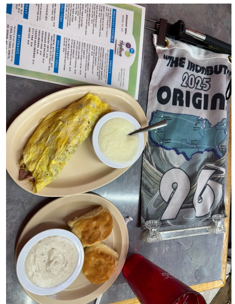
Stephen Creamer is chowing down at Hoptown