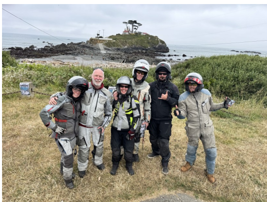
A group of riders at the Battery Point Lighthouse