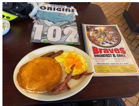
Michael Shell doesn't need to be brave to have breakfast at Braves